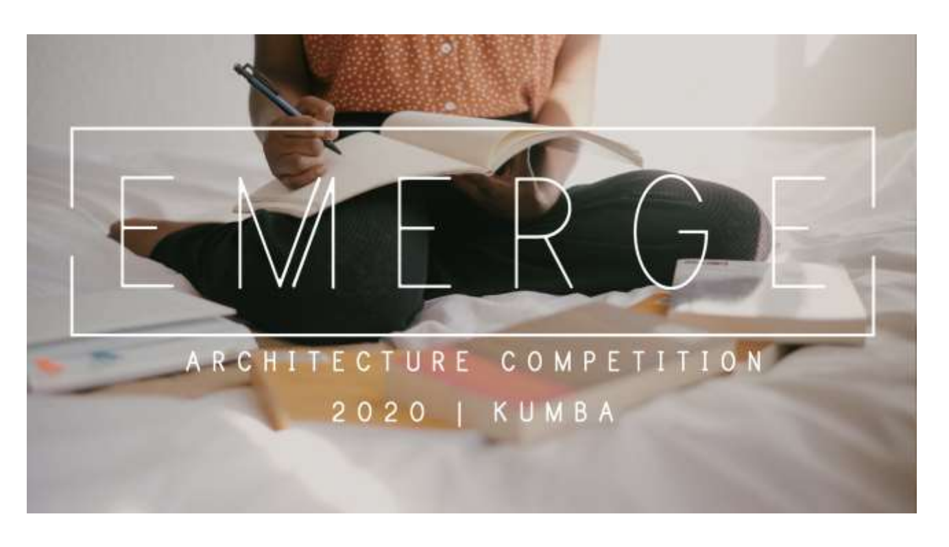
Emerge Architecture Competition 'Kumba'